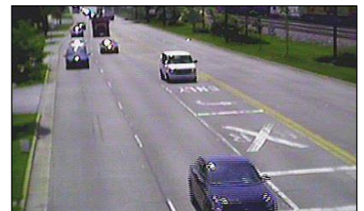
Actual Screen Images from ITS Plus Cameras

Traditional video detection cameras were designed for ITS freeway applications, not Video Detection. ITS Plus developed a camera from the ground up which address the fundamental problems faced by traditional VIVDS cameras. New features virtually eliminate the need for lens cleaning and re-alignment even under the harshest conditions. The superior design also address the issues of ice and snow build up and connector failure/water leakage. Targeting advanced/stop bar detection and failed camera replacement the ITS Pole Mount camera is a superior choice for VIVDS applications.